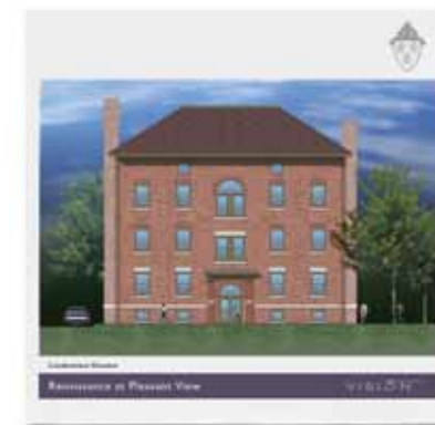
The former Our Lady of Consolation School in Pawtucket (far right) will be renovated soon and converted into the Renaissance at Pleasant View, a facility providing affordable housing units to eligible first-time homebuyers.