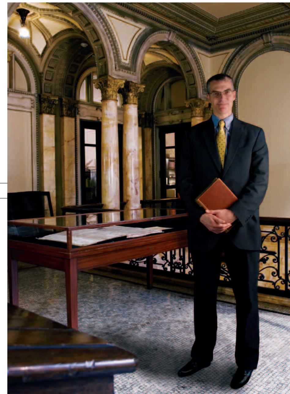
PROVIDENCE PUBLIC LIBRARY