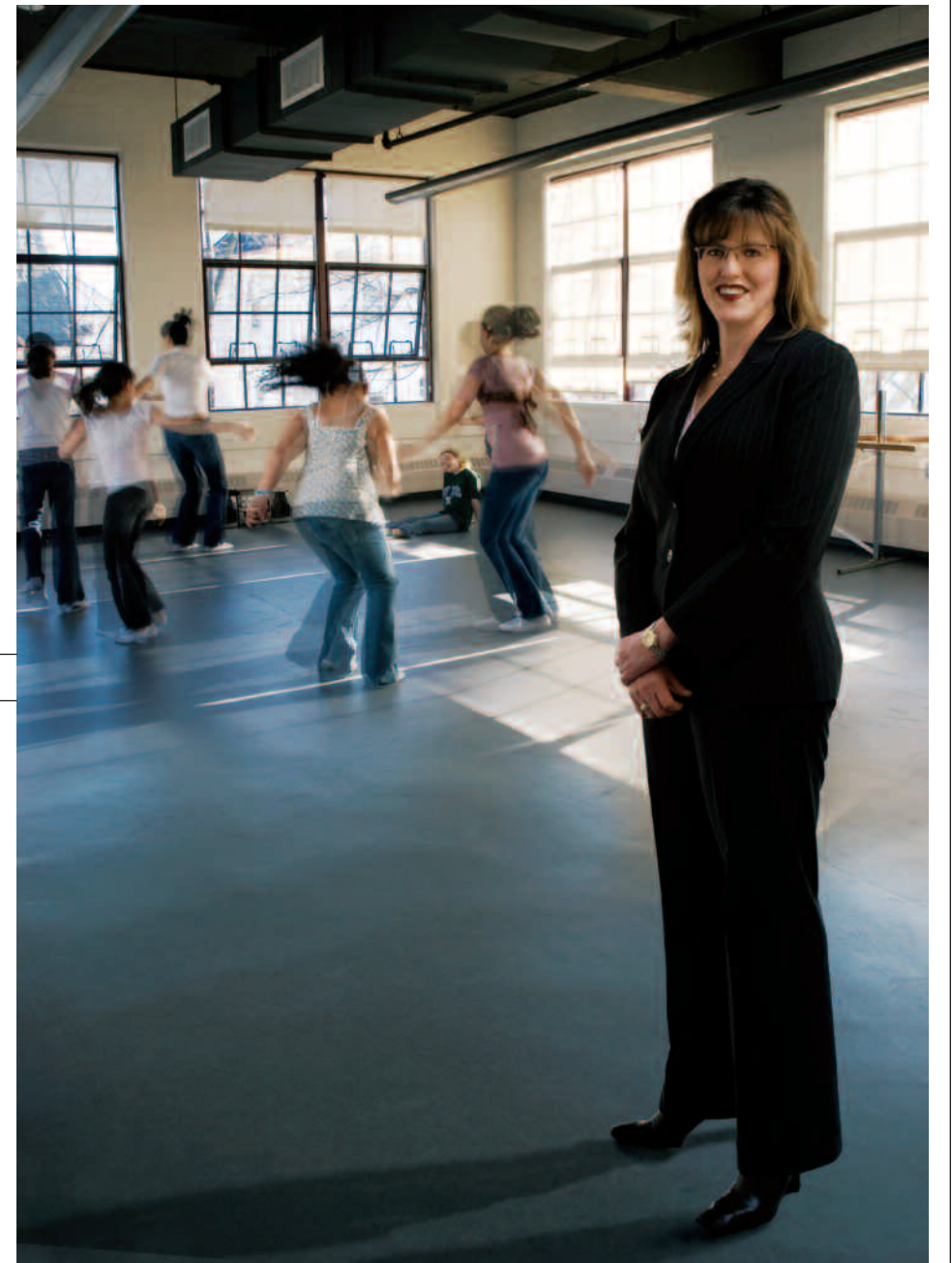
PROVIDENCE iCITYARTS! FOR YOUTH

alleged that the company had unlawfully retaliated against her for her attempt to exercise her rights. The plaintiff was seeking hundreds of thousands of dollars in compensation. The company prevailed at the District Court, where it was found that the plaintiff did not adequately state her need for accommodation in the first place. The disparate treatment and retaliation claims also failed because she was unable to prove a causal connection between her disability and her job rotation. On appeal, the plaintiff was aided by the federal Equal Employment Opportunity Commission who filed and argued as an amicus on the issue of whether the plaintiff's purported requests for accommodation were sufficiently specific, direct and linked to her disability. The First Circuit rejected the appeal and affirmed the judgment in favor of our client, the insurance company.