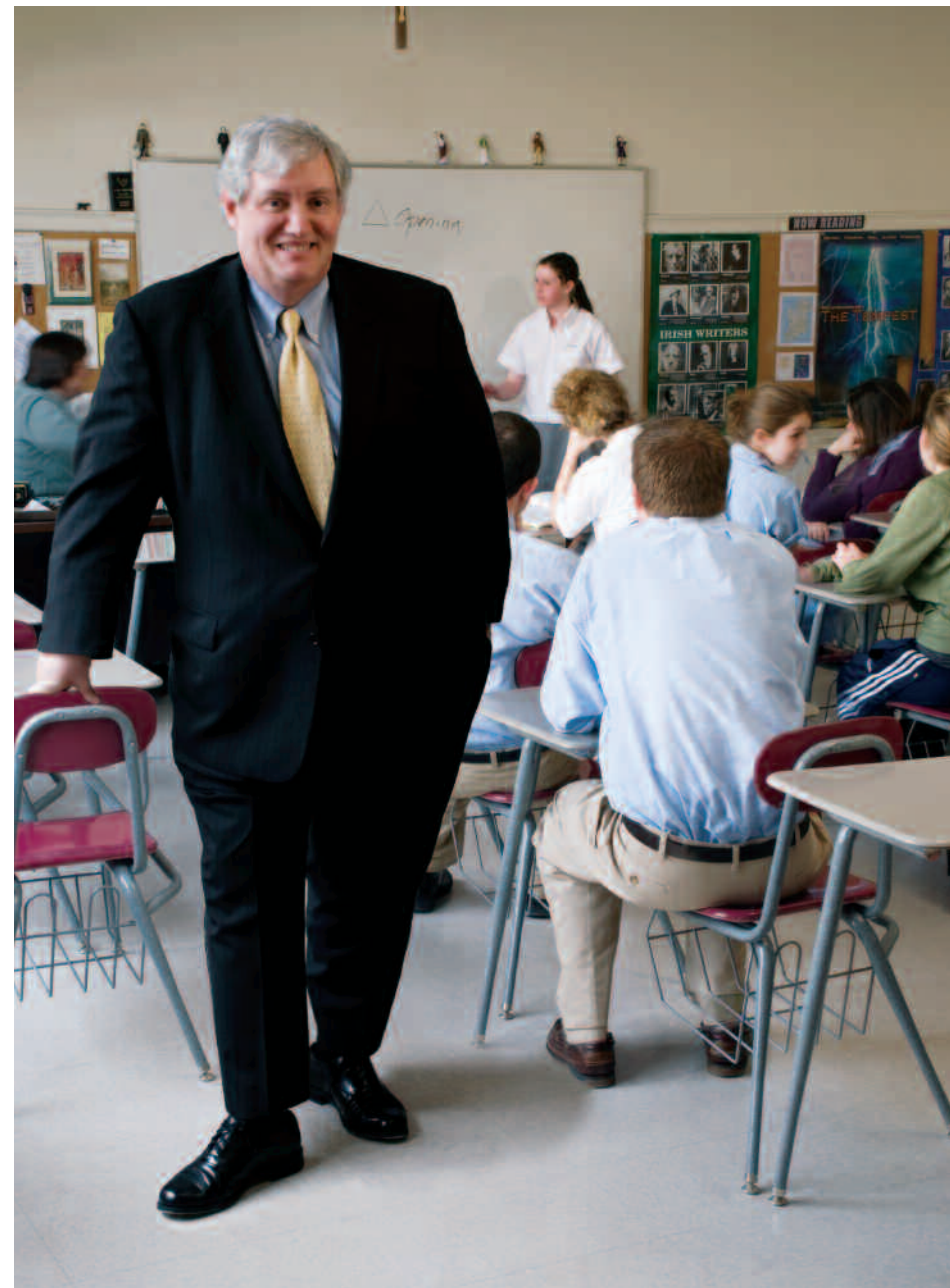
LA SALLE ACADEMY

An Americans with Disabilities Act case was tried before the US District Court for the District of Rhode Island and ultimately was decided on appeal to the United States Court of Appeals for the First Circuit. PS&H litigation attorneys represented the defendant, an insurance company. The plaintiff was an executive at the company who suffered from repeated and serious bouts of ulcerative colitis. She alleged that the company had failed to properly accommodate her disability and then discriminated against her by transferring her to a job she considered a demotion. She also