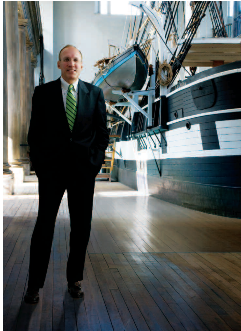
NEW BEDFORD WHALING MUSEUM